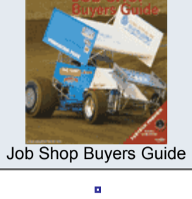
Job Shop Buyers Guide