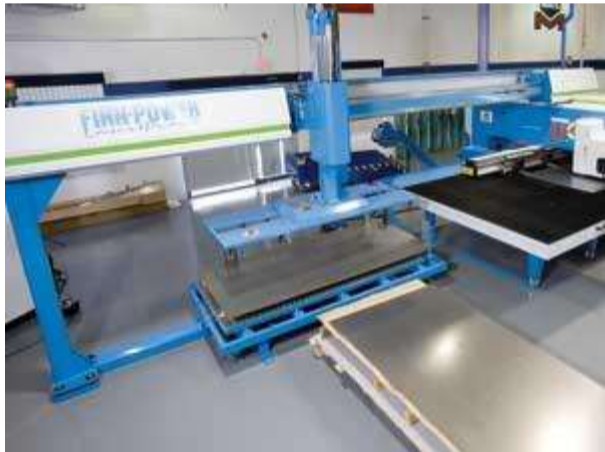
The LPE laser/punch combination can perform laser cutting, punching, nibbling, upforming, marking, tapping, bending, sorting, and stacking-all unattended, all in a single setup. Optimum use of the system means that a fabricator can use the turret punch press where it is easier or faster and the laser where it is most effective.

This system can perform laser cutting, punching, nibbling, upforming, marking, tapping, bending, sorting, and stacking-all unattended, all in a single setup. Optimum use of the Finn-Power LPE means that a fabricator can use the turret punch press where it is easier or faster and the laser where it is most effective. With this system they can look at the parts, the materials, the part design elements, the time, and the overall cost of the parts to determine the optimum process.