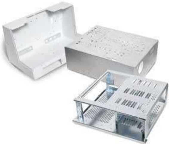
Serving its diverse customer base, Resh uses the laser and turret set up to automatically go from one job to the next.

The punching part of the system consists of a 22-ton turret punch press that combines electrical servo technology with mechanical power transmission. The net result is a system with flexibility, accuracy, and excellent forming capabilities-16 mm with no die interference; servo system for precise accuracy; low energy consumption; auto-index, Multi-Tool programmable clamp settings, and brush tables.