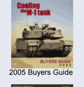
2005 Buyers Guide